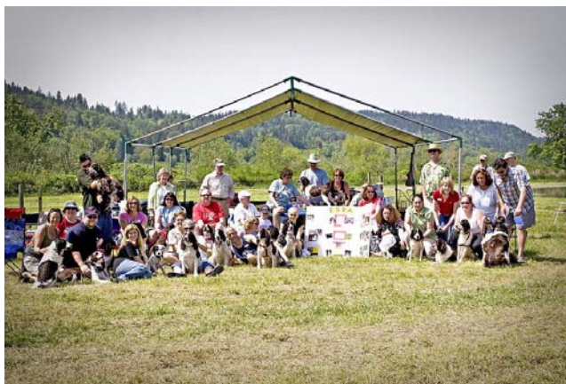
Springer Rescue picnic